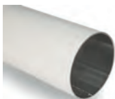
AC 730 / AC 740 / AC 750 ROUND BAR WHITE RAL 9010, 3 / 4 / 5 M.