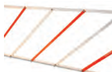
AC 590 2 M CURTAIN