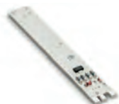
AC 770 INTERNAL LED LIGHTS